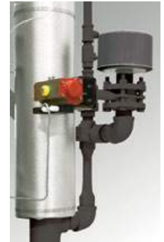
Jet Injection with A 3 Purge Technology™

Rugged temperature- & humidity-sensing technology embedded in the EMS control ensures dew point stability without the need for periodic recalibration. Constant desiccant bed monitoring uses algorithm-based protocols to deliver precise control of the A 3 Purge Technology™. The Jet Injection is engaged and disengaged as needed to boost the airflow through the off-line tower. Bed regeneration cycles are managed with precision to deliver -40°F, Class 2 dew point, and reduce compressed purge air consumption to 6% or less.